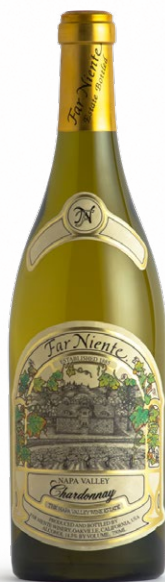
Far Niente Estate Bottled Chardonnay NAPA VALLEY RETAIL: $76.00