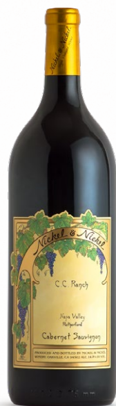
Nickel & Nickel C.C. Ranch Cabernet Sauvignon RUTHERFORD (1.5L)* RETAIL: $330.00