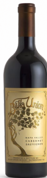
Bella Union Cabernet Sauvignon NAPA VALLEY RETAIL: $80.00