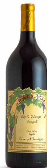
Nickel & Nickel John C. Sullenger Vineyard Cabernet Sauvignon OAKVILLE (1.5L)* RETAIL: $330.00

*Gift Boxes Available at Additional Cost