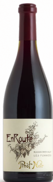
EnRoute Pinot Noir “Les Pommiers” RUSSIAN RIVER VALLEY RETAIL: $60.00