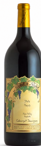
Nickel & Nickel State Ranch Cabernet Sauvignon YOUNTVILLE (1.5L)* RETAIL: $330.00