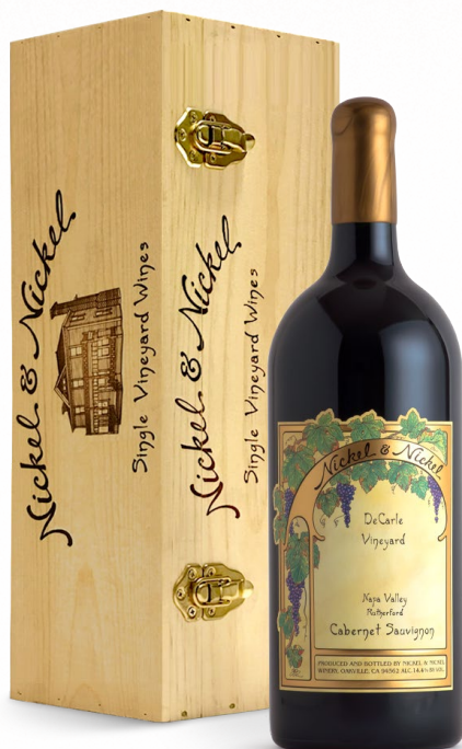
Nickel & Nickel DeCarle Vineyard Cabernet Sauvignon RUTHERFORD (3L+BOX) RETAIL: $750.00