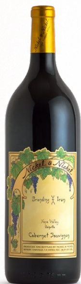
Nickel & Nickel Branding Iron Vineyard Cabernet Sauvignon OAKVILLE (1.5L)* RETAIL: $330.00