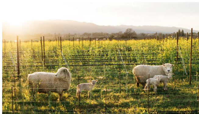
Lambs among the vines at Rudd Vineyards

In the heart of the Napa Valley, Oakville is the go-to address for California Cabernet Sauvignon, where the top producers of luxury wines tend their vines. It's home to giants like Harlan Estate, Far Niente , Dalla Valle, Robert Mondavi, Opus One, Groth, Rudd, PlumpJack Winery and Screaming Eagle, to name a mighty few.